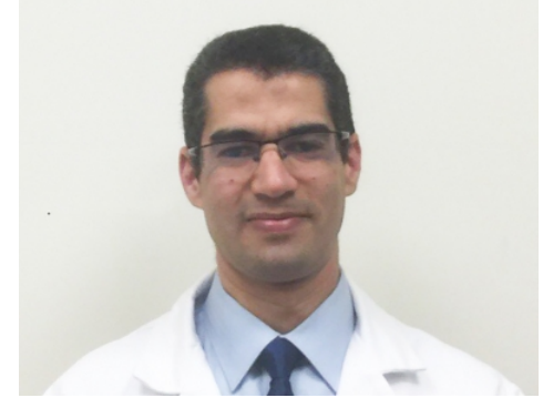
2019 & 2020 (!!)